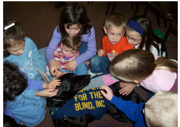
Baldwin, hard at work