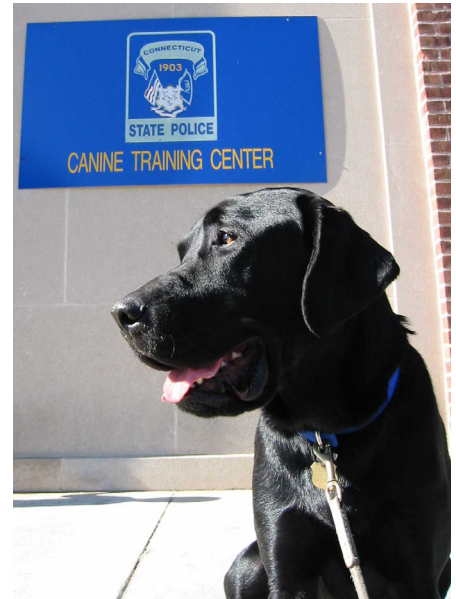
Trooper Badger looking handsome on graduation day

It is clear now that Badger insisted on that level of fitness training so that he could fulfill his role in life. It is not every dog that can pass the tests which our law enforcement agencies use to select their working dogs. Badger was selected by the Connecticut State Police for their Drug Detection program. This year's canine training class had four troopers matched with four dogs in an intensive 3 month process. The dogs are trained to find 6 types of controlled substances as well as tainted money and receive a food reward when they are successful (at last, Badger's love of "find the ball" is rewarded with food! What more could a boy want?). That training is reinforced daily, the dogs must successfully find drugs before they receive their meals. We were informed that Badger used his physical size and strength to ... er ... dominate the class.