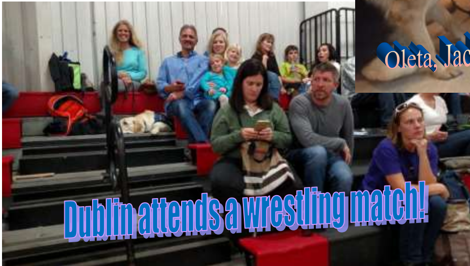
Dublin attends a wrestling match!