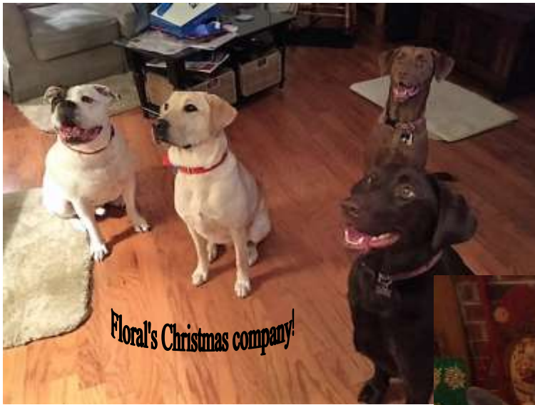
Floral's Christmas company!