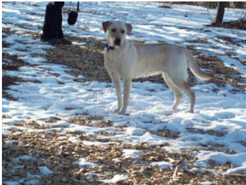
Bangle Goes IFT!