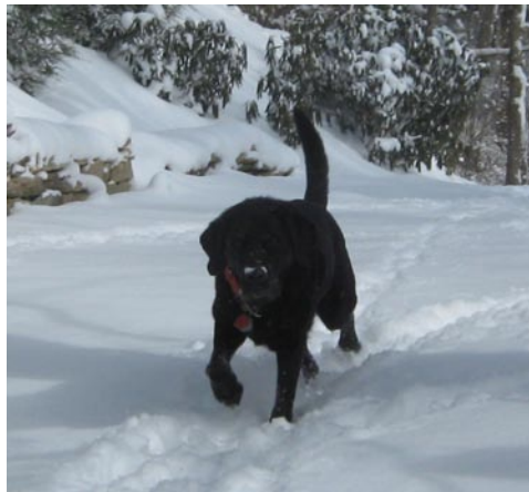
Kearney hiking in the hills!