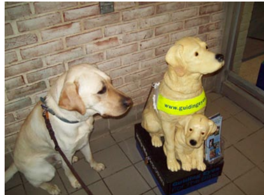
Simba poses with a GEB statue.