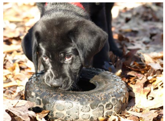
Ray - His toy is almost as big as he is!