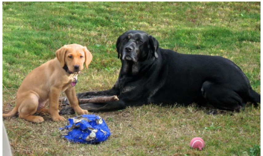
Abigail with best friend, Midnight