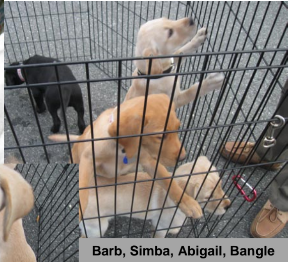
Barb, Simba, Abigail, Bangle