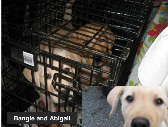
Bangle and Abigail