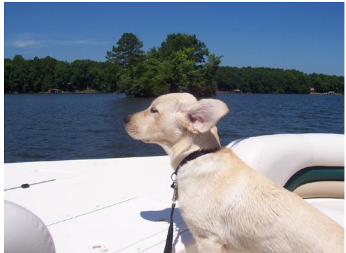
Harper's first boat ride - Enjoying the wind in his ears!