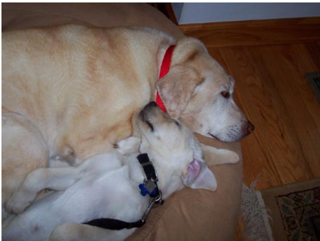
Harper curled up with Lake