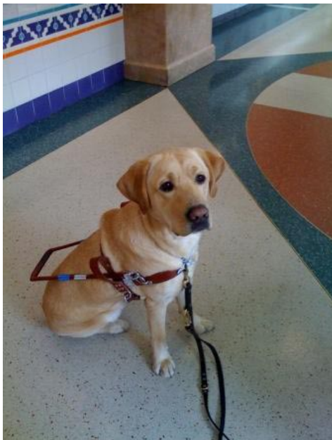
Withers at the Training School