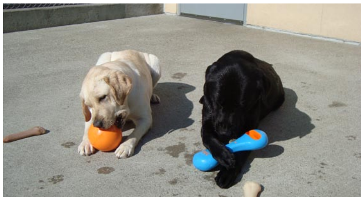
Many thanks to Planet Dog for donating the toys these dogs are enjoying!

The icing on the cake is that our dogs actually get a break from the kennels once in a while. The trainers sometimes take the dogs out for a day of fun at nearby parks or lakes. The staff welcomes dogs into their offices during the day and into their homes at night. Volunteers also take the dogs home for weekend getaways.