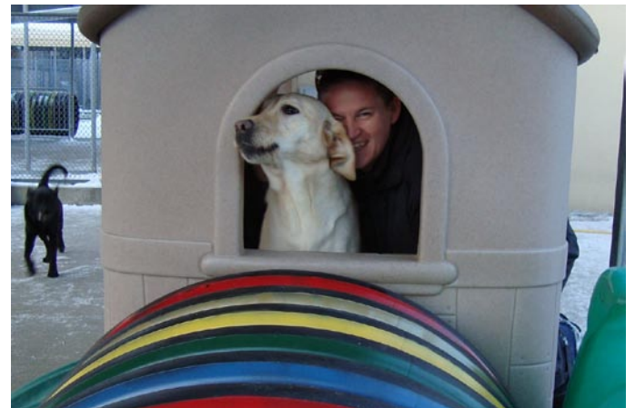
Visa having fun with her trainer

In the kennels our dogs are enjoying classical music, comfortable beds, scent enrichment (coconut, lavender and mint extracts are sprayed on the kennel walls), hanging toys, ice blocks, frozen Kong's, and one on one time with staff and volunteers. They have special toy time when they have the opportunity to play with different textured toys in a small controlled group outside their runs. They enjoy Community Run three times a day where they can play outside with larger groups of dogs in areas filled with kites, playground equipment, bubble machines, and swimming pools. The toys and activities are varied to reduce boredom. When our dogs are not training, resting or playing, they may be enjoying their weekly 15 minute massage in the peaceful massage therapy room with staff and volunteers who have been trained in soothing massage techniques.