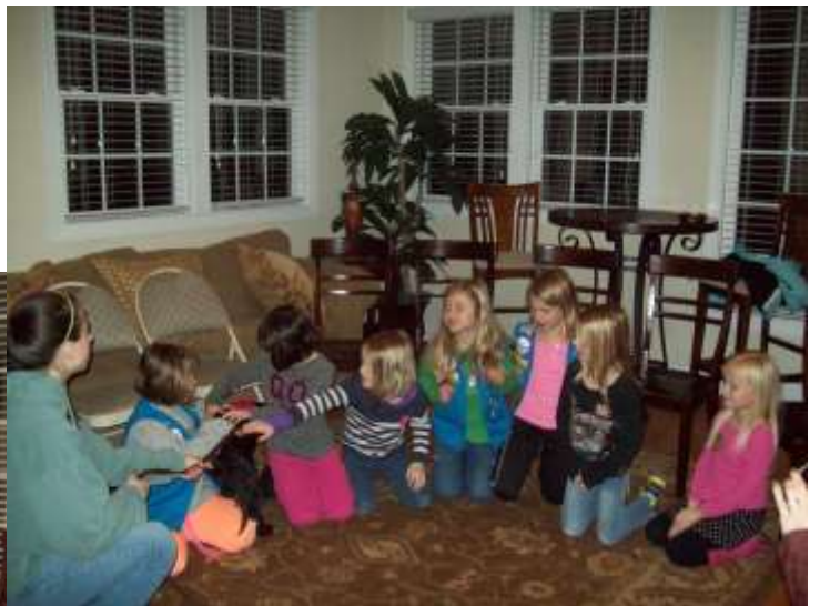
The girls couldn't resist little Coal!