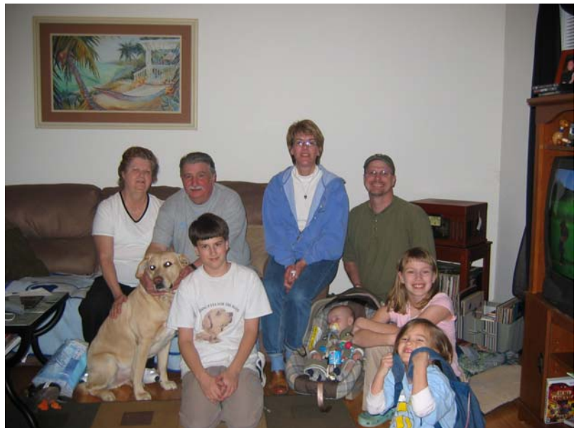
Rocky enjoys a day with both of his families!

I am looking forward to keeping in contact with her and am so grateful we were a part of his upbringing. Seeing her, I was also able to ask questions about how he helps her, what she does to maintain his guiding skills and so on. Not every person would have been open to that but she so obviously loved him and wanted to show him off!!