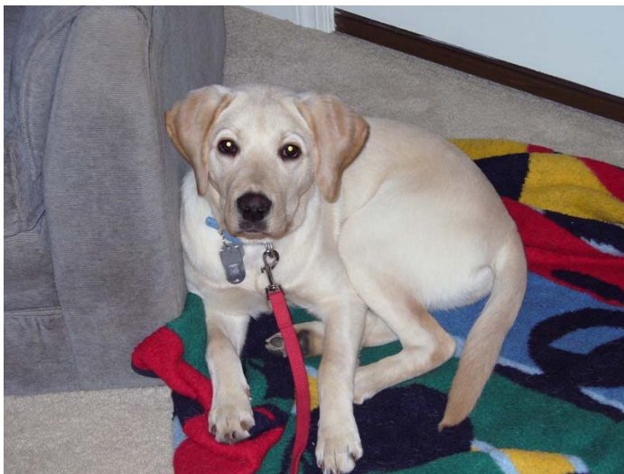
Wynett – Now that's a pretty face!