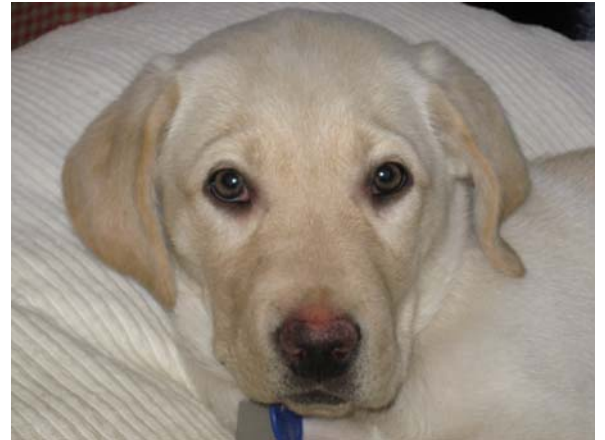
Vance looks pretty comfy on his new bed. "I think I just might like this place!"