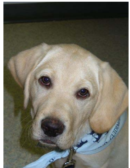
Oberon "King of the Faeries"