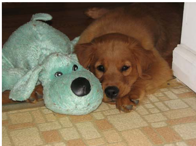
Everybody needs a friend, right Sandy?