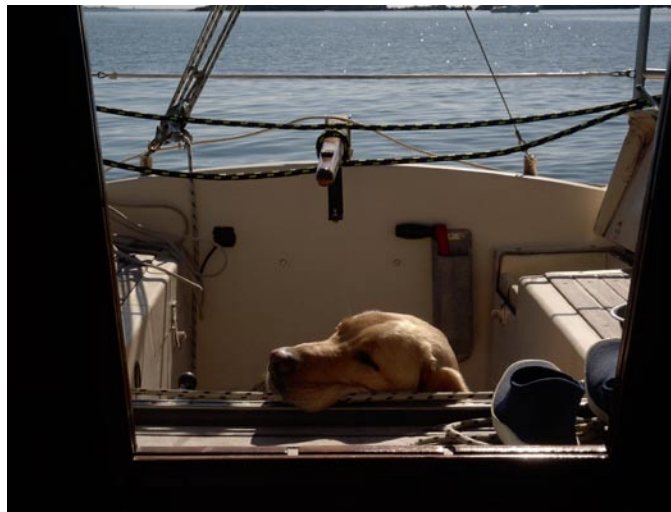
Harry Loves Sailing